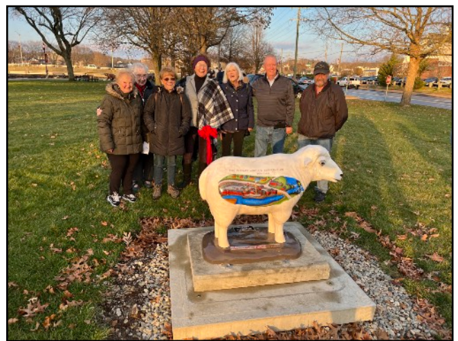
Members of the Aspinock Historical Society pose with the sheep sculpture in Rotary Park.

Credit to The Putnam Town Crier and Northeast Ledger