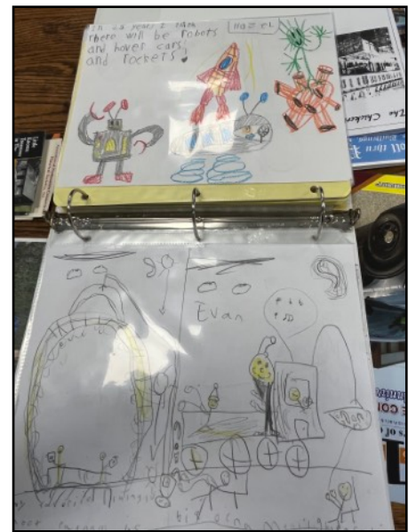
Third graders contributed drawings and essays about the future of Putnam.